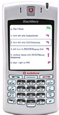
Figure 4 – Plan and follow a route, using your BlackBerry