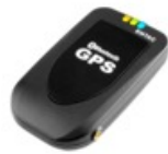
Figure 3 – BerryVine Companion supports usage of NMEA Bluetooth® GPS receivers